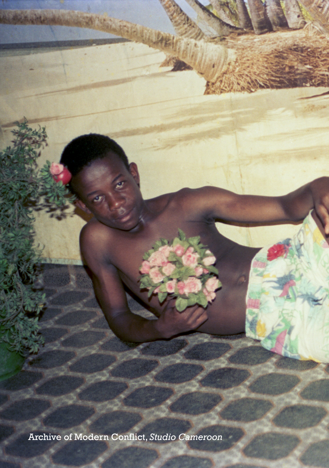
Archive of Modern Conflict, Studio Cameroon