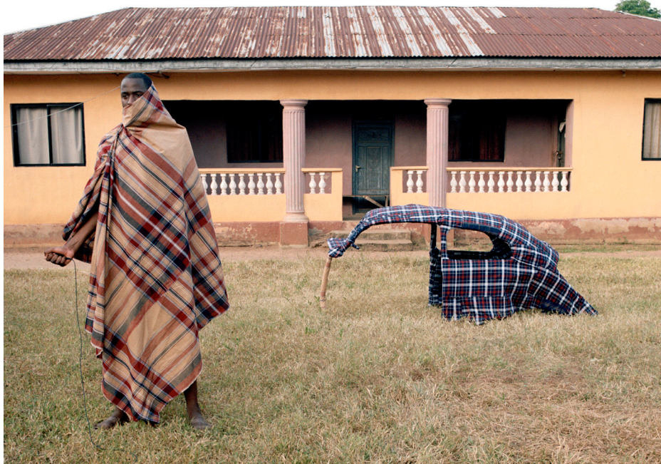
Patchwork, My Granddad's Car, 2012 24 cm x 24 cm, Dibond