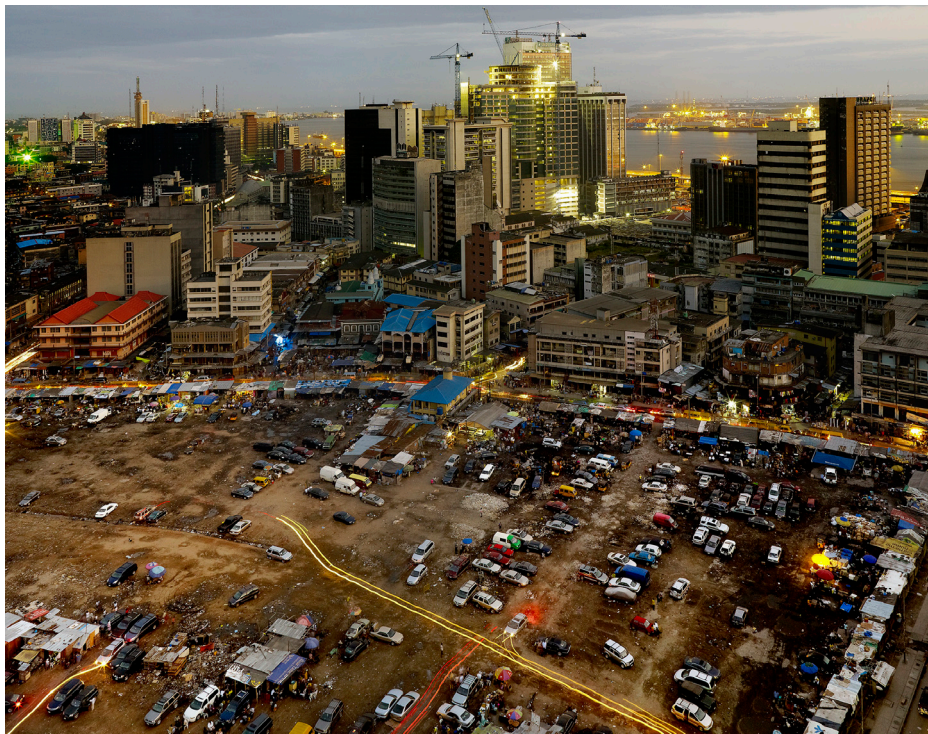
Center of Excellence, (2012) 101 cm x 130 cm