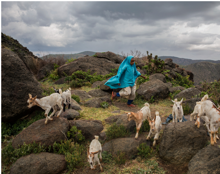
Sheikh Mountains, Somaliland, 2013 60.67 cm x 100 cm, Dibond