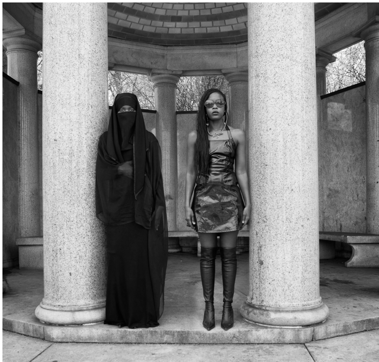
Deconstructing SHE, 2013 65 cm x 90 cm, Dibond