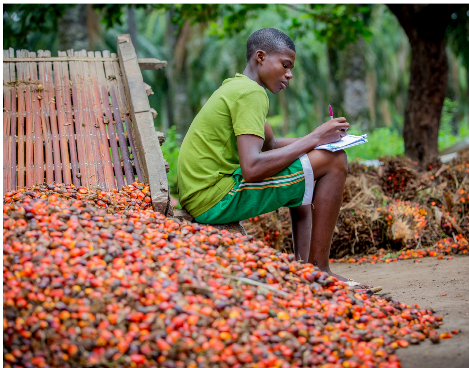
Red Gold, 2014 76 cm x 51 cm, Dibond