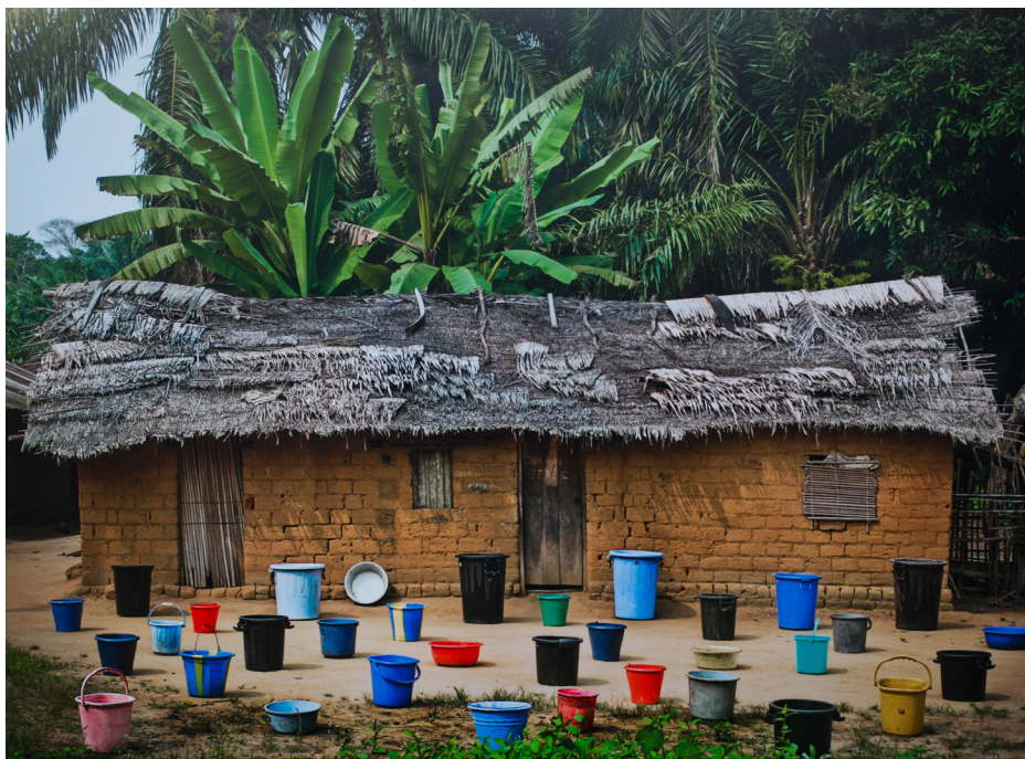
Made in China II, On the Road from Bikoro to Bokanda, 2012 75 cm x 100 cm, Dibond