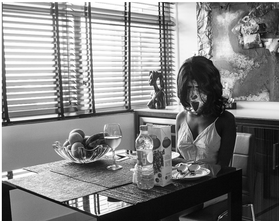
The Masked Woman, 2013 76 cm x 51.15 cm, Dibond