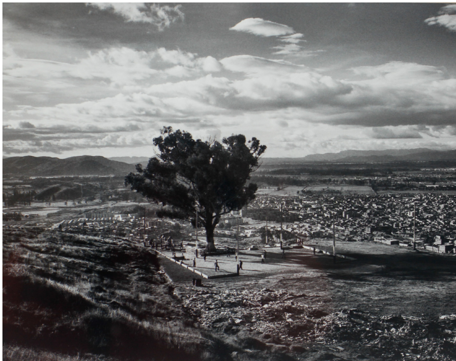
Untitled from Via Pan Am (2012) 20 cm x 30 cm, Silver Gelatin Print