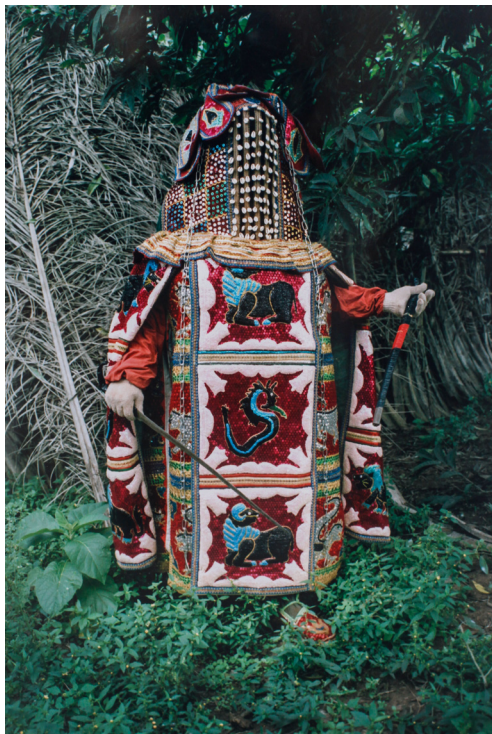
Untitled from Egungun Masquerades, 2013 21 cm x 31.5 cm, Archival Paper