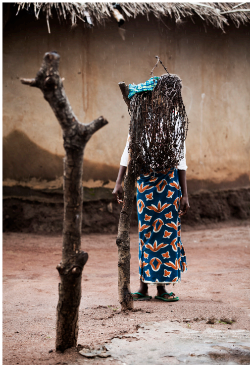
Material Culture, 2014 114 cm x 76 cm, Dibond