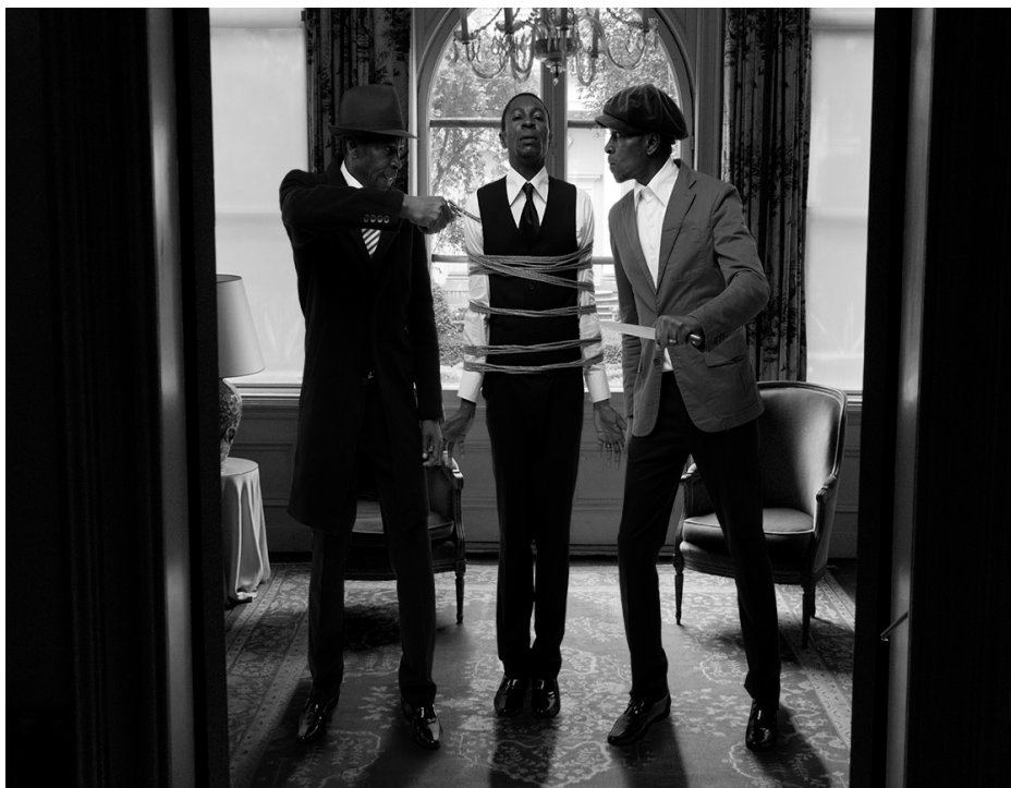
Treachery Is Closer Than You Think, 2012 80 cm x 120 cm, Dibond