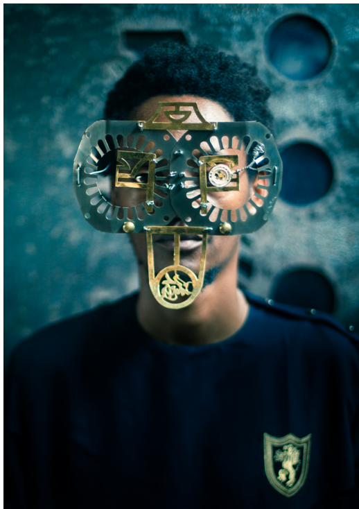
Untitled, 2013 65 cm x 76.2 cm Dibond